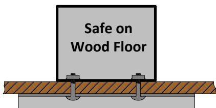
Secured by 4 Cup Head Coach Bolts (nuts inside safe) into angle Iron below the floor. Angle Iron should run 400mm past edges of safe.